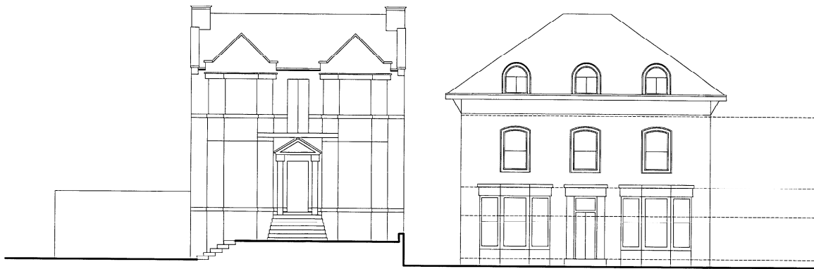
42 Yarm Road